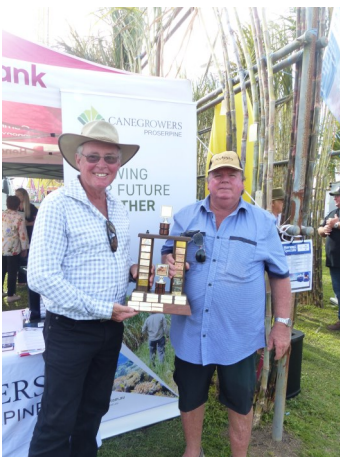
Section 7 1st Place: Lethebrook Branch