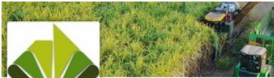
CANEGROWERS Podcast CANEGROWERS advocates on behalf of sugarcane growers in Australia. This podcast series examines some key issues and challenges and celebrates the successes.

If you do not have your member number, please contact the CANEGROWERS Proserpine office on 4945 1844.