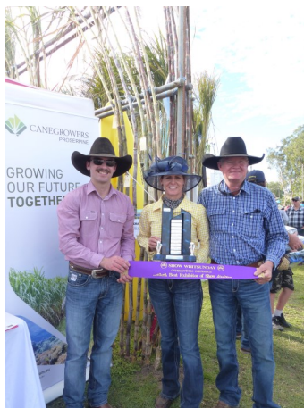
Section 12 1st Place: Watts Farming