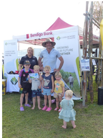
Section 11 2nd Place: Valmadre Farming