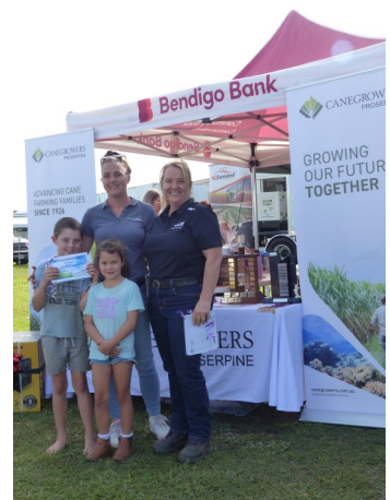
Section 11 3rd Place: Moore Family Trust